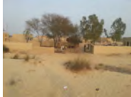
Dwellings in the Cholistan Desert ( https://commons.wikimedia.org/wiki/File:Dwellings_in_the_Cholistan_Desert.jpg ) By FarooqAkhtar723 is licensed under CC BY-SA 3.0