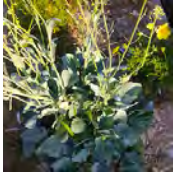
Arya- field mustard-graha nuansa-2019-5 ( https://commons.wikimedia.org/wiki/File:Arya- field mustard-graha nuansa-2019-5.jpg ) By Aris riyanto is licensed under CC BY-SA 4.0