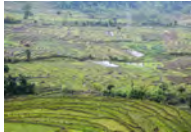
Landscape of Sikkim ( https://commons.wikimedia.org/wiki/File:Landscape_of_Sikkim_01.jpg ) By Bernard Gagnon is licensed under CC BY-SA 4.0