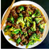
Beef and broccoli stir fry