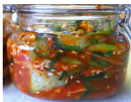
Lovely home made cucumber kimchi