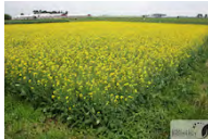
Canola ( https://flic.kr/p/9Yfbyg ) By Great Lakes Bioenergy Research Center, used with permission