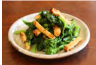
Japanese broccoli rabe, fried tofu croutons, mustard sauce