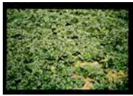
Wuta-cai Of Shanghai In China = 上海市のタアツアイ ( https://flic.kr/p/XGnyx5 ) By JIRCAS Library is licensed under CC BY 2.0