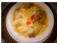
Kapuska with veal ( https://commons.wikimedia.org/wiki/File:Kapuska_with_veal.jpg ) By E4024 is licensed under CC BY-SA 4.0