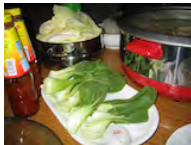
chinese cabbage