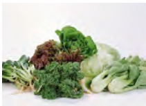
( https://www.rawpixel.com/image/5915676/photo-image-background-public-domain-leaf ) is licensed under CC0, Public Domain