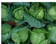
Savoy cabbage ( https://flic.kr/p/7eSwUV ) By Nick Saltmarsh, licensed under CC BY 2.0