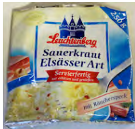
German sauerkraut with bacon