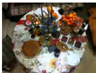
Божиќна посна трпеца ( https://commons.wikimedia.org/wiki/File:Божиќна_посна_трпеца.jpg ) By Orhidejasonce is licensed under CC BY-SA 4.0