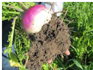
Soil Health RO ( https://commons.wikimedia.org/wiki/File:Soil_Health_RO_01_(39071867271).jpg)