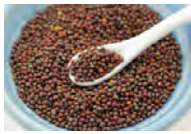
Brown Mustard Seed (Close)