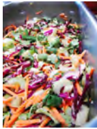
Cole Slaw Coming Up ( https://flic.kr/p/6WknA4 ) By Vegan Feast Catering, licensed under CC BY 2.0