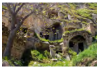
Ürgüp - panoramio ( https://commons.wikimedia.org/wiki/File:%C3%9Crg%C3%BCp_-_panoramio.jpg ) By Alexey Komarov is licensed under CC BY 3.0