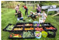
Undergraduate students pose after harvesting fresh produce