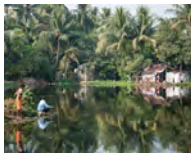
Scenery of rural Bengal