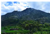
Hindu Kush