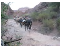
Pack Mule Train