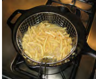
Fries or chips cooking in oil in a chip-pan