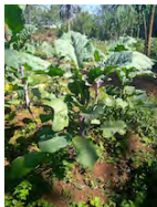
Habesha gomen in Ethiopian garden ( https://commons.wikimedia.org/wiki/File:Habesha_gomen_in_Ethiopian_garden.jpg ) By Ztmcfaul, Public Domain