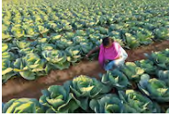
Farmer working in Field