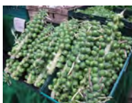
Brussels Sprouts