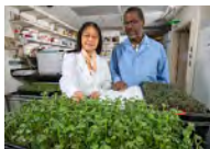
( https://www.ars.usda.gov/oc/images/photos/apr17/d3769-1/ ) Photo courtesy of USDA ARS