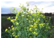
20221104 Raapzaad Bronnergerveen