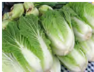
Napa Cabbage 大白菜 ( https://flic.kr/p/XGnyx5 ) By beautifulcataya is licensed under CC BY-NC-ND 2.0