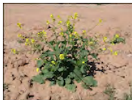
Brassica nigra