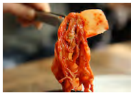
Kimchi Korean food traditional food