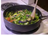
Stir Fry Vegetables in Pan