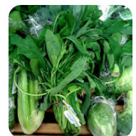
Grellos (cime di rapa)