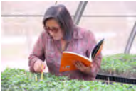
La Molina Plant Breeding Lab ( https://flic.kr/p/H3nBad ) By IAEA Louise Potterton is licensed under CC BY-NC-ND 2.0