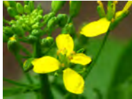
Flowering Broccoli Raab